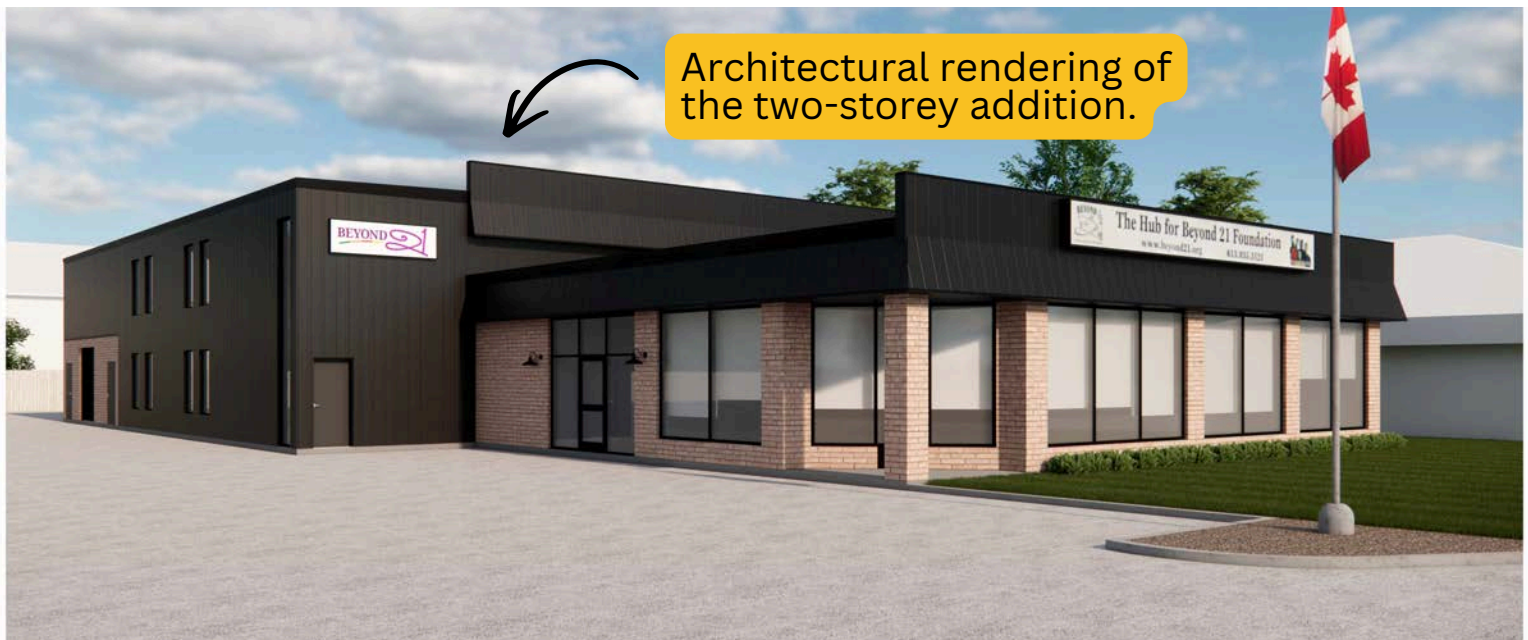
Architectural rendering of the two-storey addition.