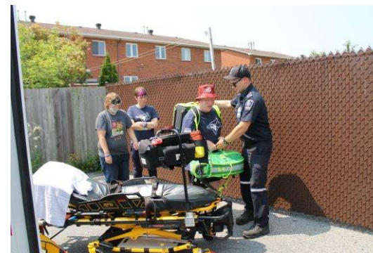
Ambulance visit from a paramedic friend