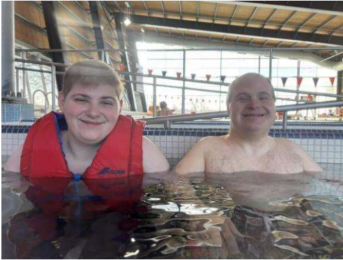
Hanging out in the hot tub at the Aquatic Centre 🐦