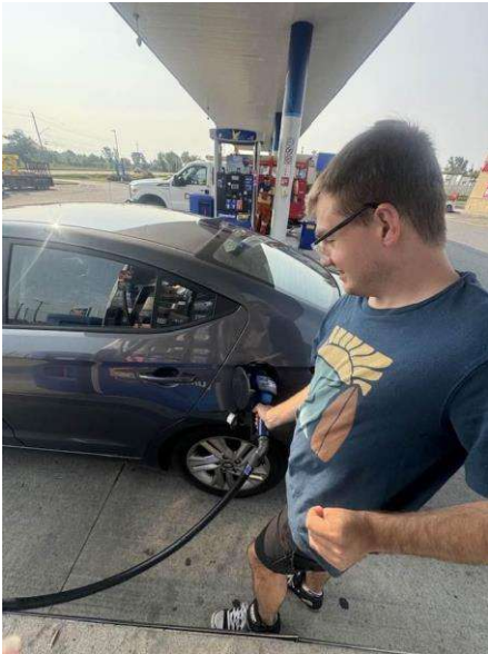
Fueling up! 🚗🔌