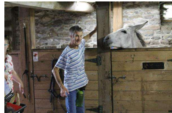
Making friends at Bee Meadow Farm 🐾