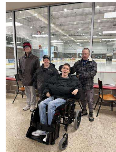
Just a guy's day at the Benson Centre 🏠