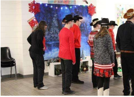
Our Christmas line dance 🦄