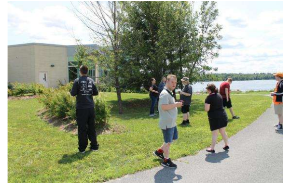
Taking photos at the Power Dam visitor center 📷