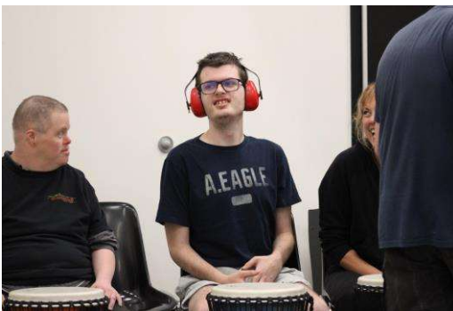
Our own drummer boy 🥁