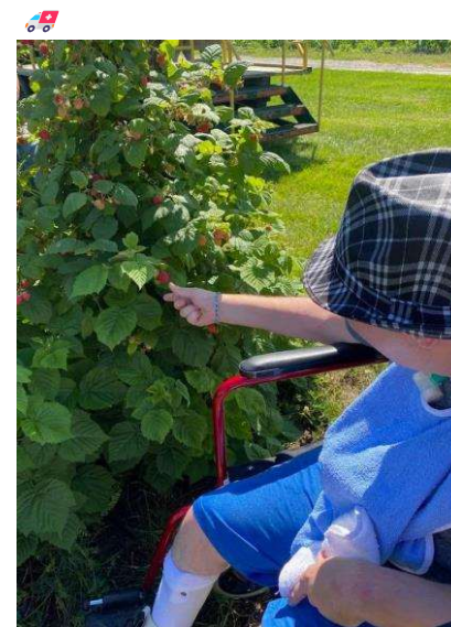
It's berry fun at the Avonmore Farm 🍓