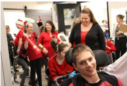
Behind the scenes of our show