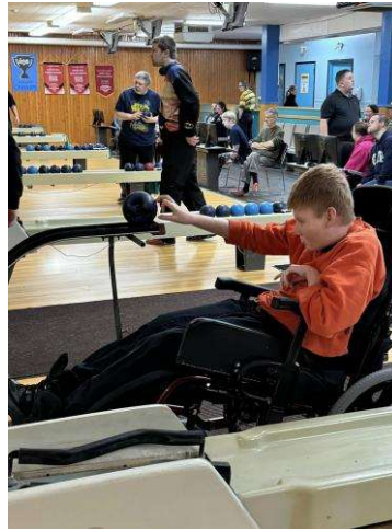
Best bowler in town 🎳