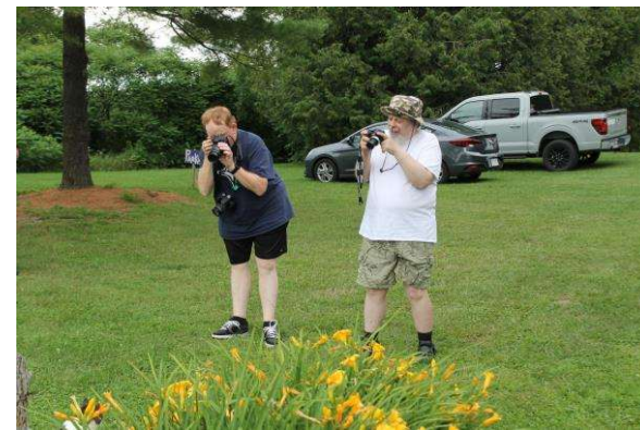
Our photographers taking photos at the Lavender farm in South Glengary 🌸