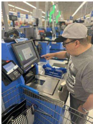
Will checking out at Walmart ✓

Our participants selected many photos of community activities we have experienced from early last year till now!