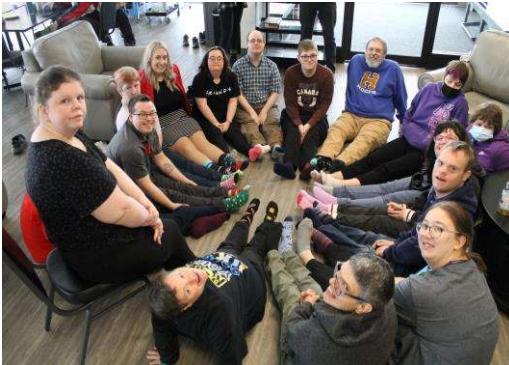
Wearing mismatched socks for World Down Syndrome Day 🧦