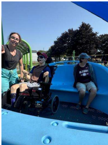
Visiting Cornwall's newly accessible Park of Hope 🇦🇨