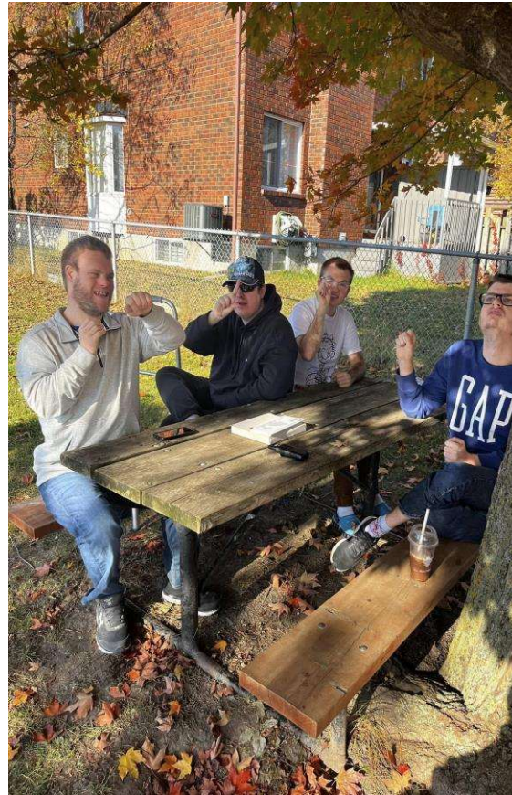
Doing program at the park 🍁