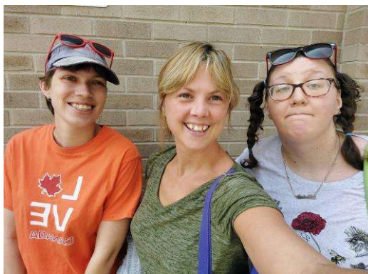
Girls trip to the mall