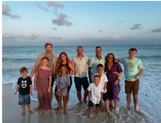
My family and me at the beach!