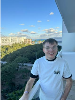
At the resort!